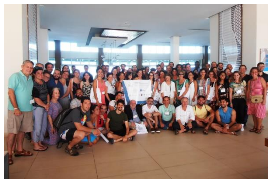
2nd AS&W October, 2018, Ocean Vista Azul Hotel, Varadero, Matanzas, Cuba

Deadline for application: New date for deadline submission: July 2 nd , 2021